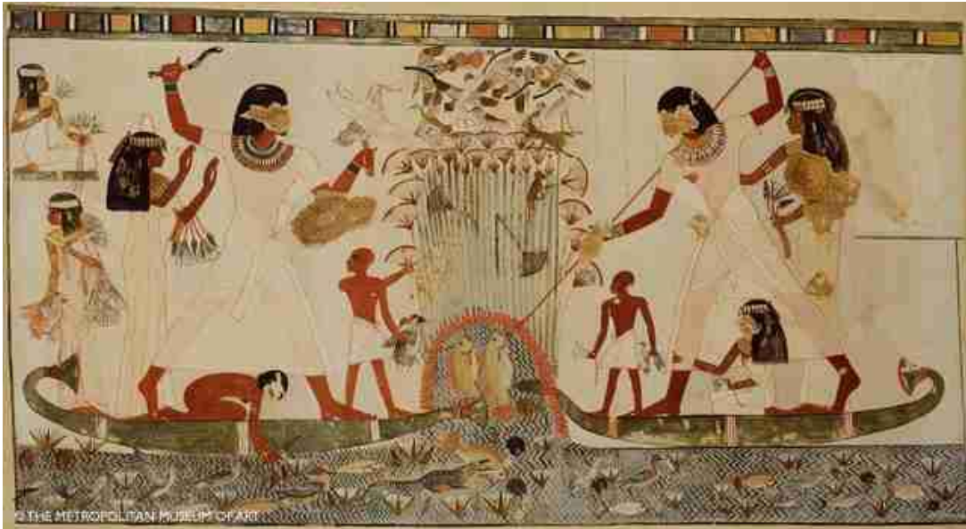
Hunting and fishing from boats made of papyrus reeds Can you find the crocodile?