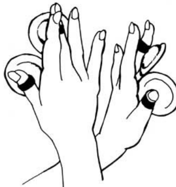
Technique for playing pairs of small cymbals