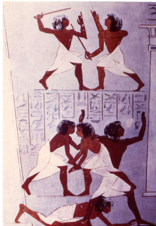
Fencing and wrestling