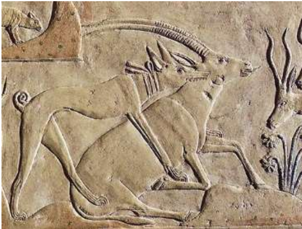
Hunting with a dog