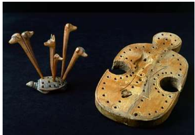
Hounds and jackals