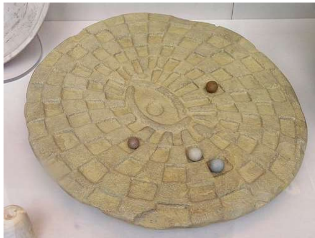
Mehen or Snake game