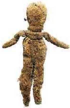
Rag doll stuffed with papyrus