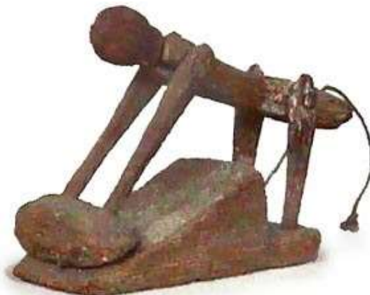
This doll ground grain when the string was pulled

These wooden dolls with beaded hair may have been toys or symbols placed in tombs