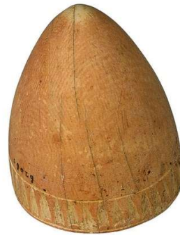
Spinning tops (first one from Tutankhamun's tomb)