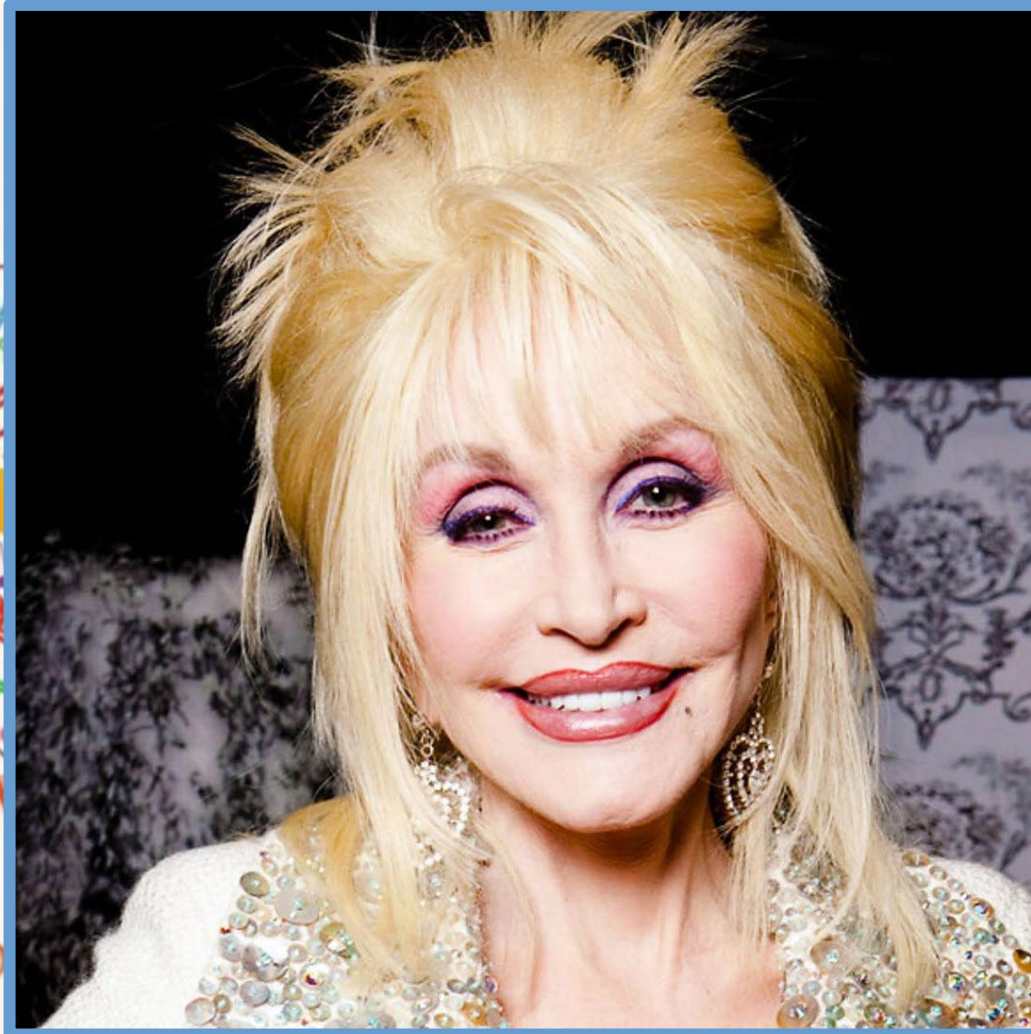
Dolly Parton (b. January 1946)