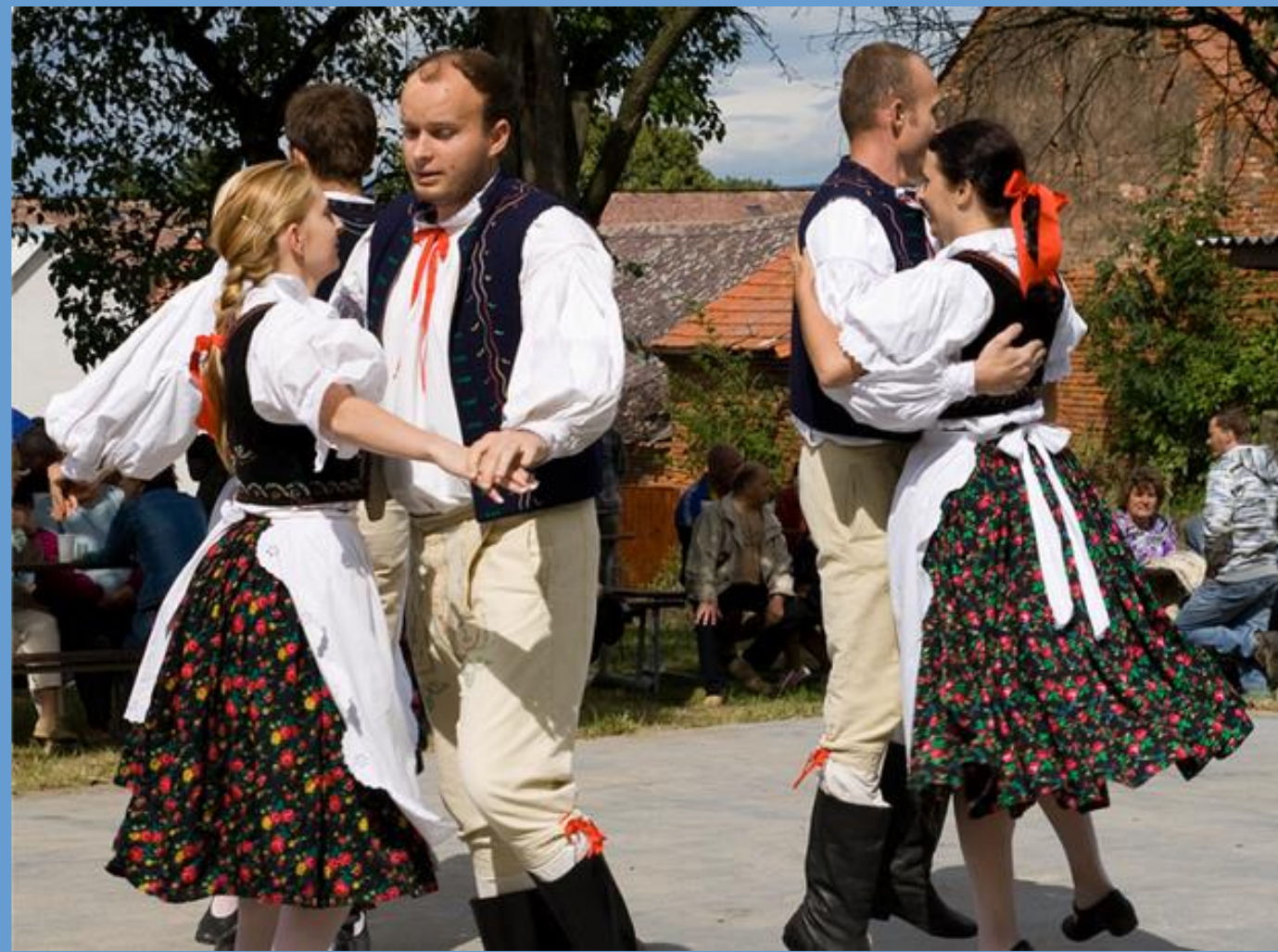
A Slavonic Dance by Dvořák