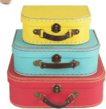
Suitcases & Briefcases