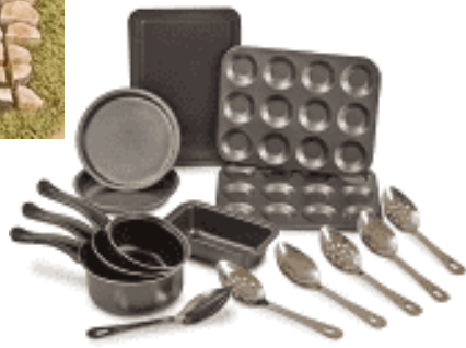
Cooking Pots and Utensils