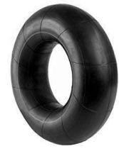
Tyres of different sizes