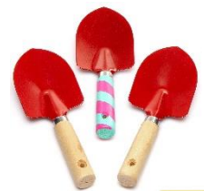
Garden Trowels and Brooms