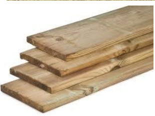
Wooden Planks, Blocks or Offcuts