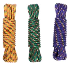
Nets Or Ropes