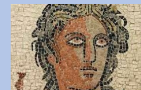
mosaics were a form of art made from thousands of tiny square tiles. Mosaics often decorated rich peoples' houses.