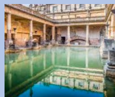
The Romans created new ways to keep clean and hygienic, including public bath houses. Public baths have become swimming pools.