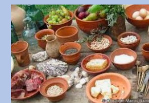
much of Roman food was like ours: bread, cheese, fish, meat. They also enjoyed bees, brains, and hooves!