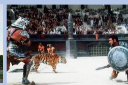
the Colosseum was a theatre where people could watch Gladiators fight each other ...to the death!