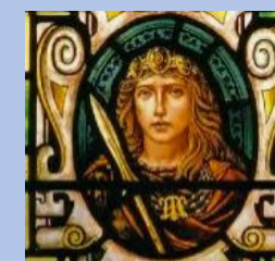
Boudicca was Queen of the Iceni, a tribe of Britons. She fought against the Romans.