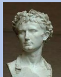
the first Roman Emperor was Augustus